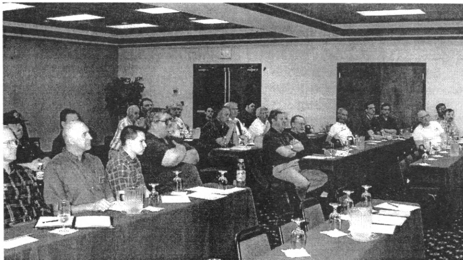
Annual Meeting Attendees Pay Close Attention

There were no show-stopping issues brought up, virtually all the members' questions generated little debate, and the two incumbent IRA Directors whose terms were expiring were unanimously reelected for two more years. It looks like, the members are still happy with the performance of their officers and